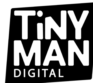
Tiny Man Digital